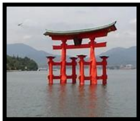
Experience Local Culture